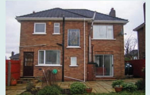
Above: Before renovation and extension.

➤ keeping with the existing house. The decision was made early on to use a similar palette of materials to the existing house but use simple and well proportioned openings to give the building a clean, modern feel.